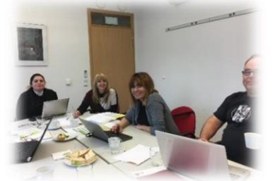
Working on Modules in Berlin

The Job Broker project aims to develop and design a new programme and network to support the newly-emerging occupational profile of the 'Job Broker' in Europe. Together 8 European countries will develop and validate jointly a 'new' curriculum programme which contributes towards improving the quality, efficiency & relevance (attractiveness) of vocational education and training (VET) to the needs of the labour market. By validating a Curriculum Programme it will help VET providers in the EU to increase their success rate in securing sustainable jobs for the job-seekers. In addition, through the standardisation of competencies within the role of the Job Broker, the project will foster the mobility of these skilled professionals.